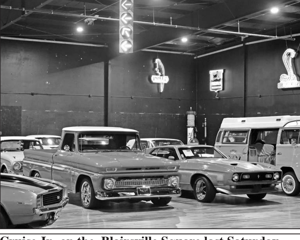
Cruise-In on the Blairsville Square last Saturday